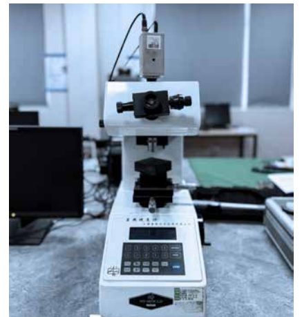
显微维氏硬度机 Micro Vickers Hardness Tester