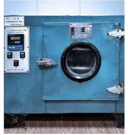
恒温干燥箱 Constant Temperature Drying Oven