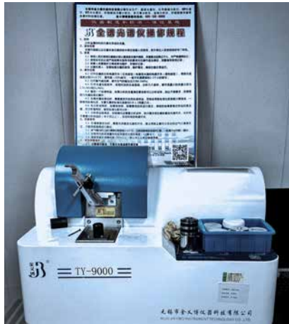
光谱仪 Optical Spectrometer