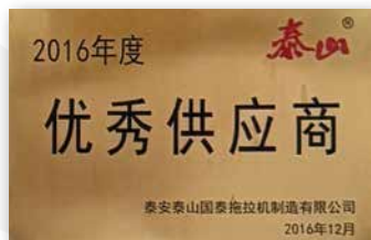
OUTSTANDING SUPPLIER AWARD