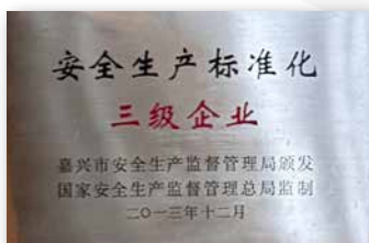
SAFETY PRODUCTION STANDARDIZATION LEVEL 3 ENTERPRISE