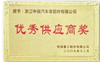
OUTSTANDING SUPPLIER AWARD