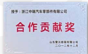
COOPERATIVE CONTRIBUTION AWARD