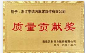
QUALITY CONTRIBUTION AWARD