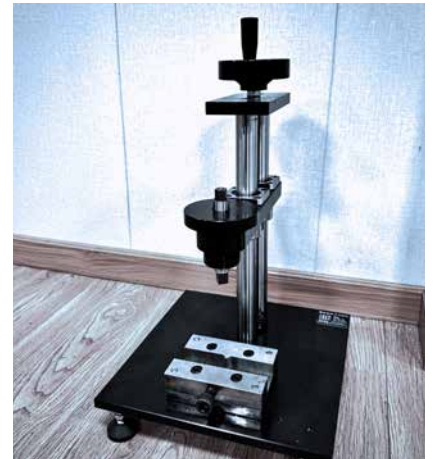
螺丝扭断力试验机 Screw Breaking Force Tester