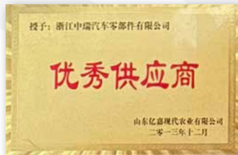
OUTSTANDING SUPPLIER AWARD