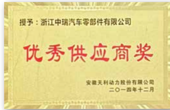
OUTSTANDING SUPPLIER AWARD