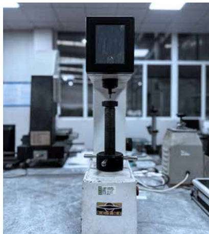
洛氏硬度计 Rockwell Hardness Tester