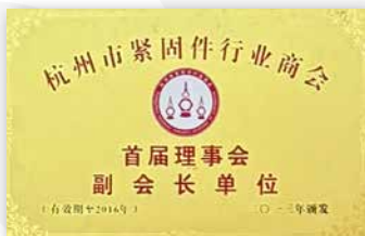
THE FIRST VICE PRESIDENT UNIT OF THE COUNCIL