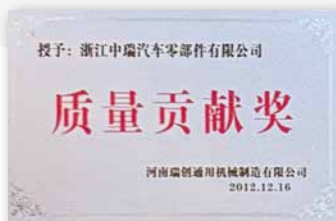
QUALITY CONTRIBUTION AWARD