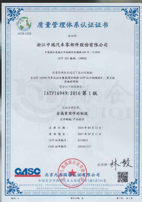
CERTIFICATE OF REGISTRATION