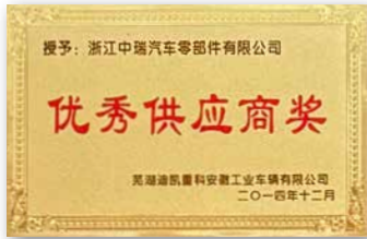
OUTSTANDING SUPPLIER AWARD