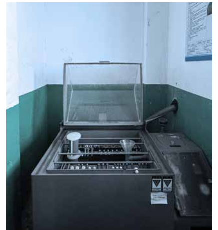
盐雾机 Salt Spray Tester