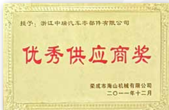
OUTSTANDING SUPPLIER AWARD