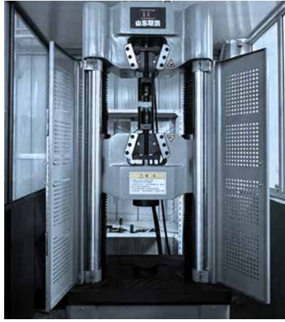
拉力机 Tensile Strength Tester